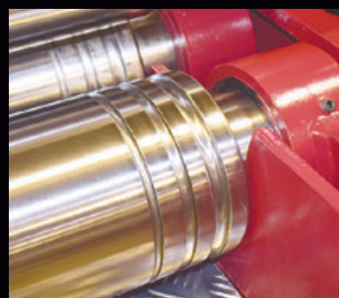
Round Bar Grooves