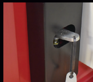
Pinch Gap Control