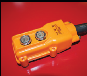
Hand-Held Rotation Control